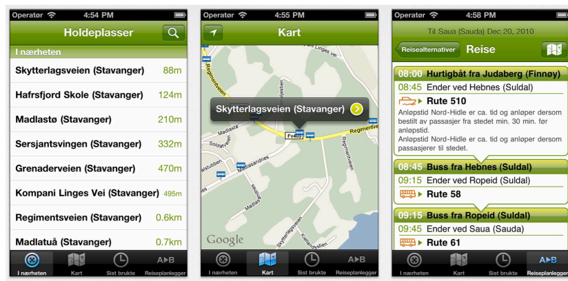
Figure 1: 3 iphone screen captures from Kolumbus scheduling app

Then in April 2013 a real-time app was distributed. This one does not plan your travel, but it identifies where you are with bus stops closest to you, and then tells you which busses will connect at that stop and when they are expected including delays. This real time functionality is available for iphone/ ipad, android, and general website. But the real-time information is also on screens at bus stops and on a screen in the busses. The real-time app is the most popular app as it enables its users to optimize their time due to better knowledge on actual transport options.