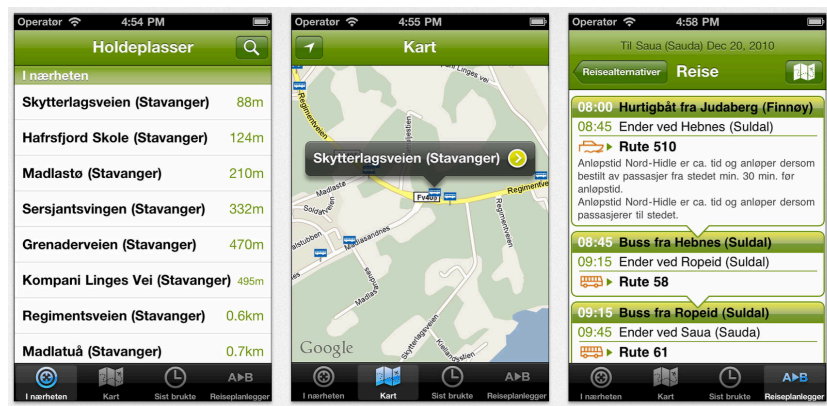
Figure 1: 3 iphone screen captures from Kolumbus scheduling app

Then in April 2013 a real-time app was distributed. This one does not plan your travel, but it identifies where you are with bus stops closest to you, and then tells you which busses will connect at that stop and when they are expected including delays. This real time functionality is available for iphone/ ipad, android, and general website. But the real-time information is also on screens at bus stops and on a screen in the busses. The real-time app is the most popular app as it enables its users to optimize their time due to better knowledge on actual transport options.