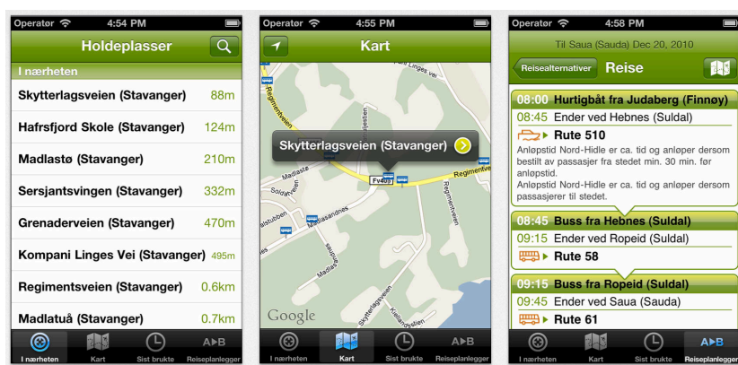
Figure 1: 3 iphone screen captures from Kolumbus scheduling app

Then in April 2013 a real-time app was distributed. This one does not plan your travel, but it identifies where you are with bus stops closest to you, and then tells you which busses will connect at that stop and when they are expected including delays. This real time functionality is available for iphone/ ipad, android, and general website. But the real-time information is also on screens at bus stops and on a screen in the busses. The real-time app is the most popular app as it enables its users to optimize their time due to better knowledge on actual transport options.