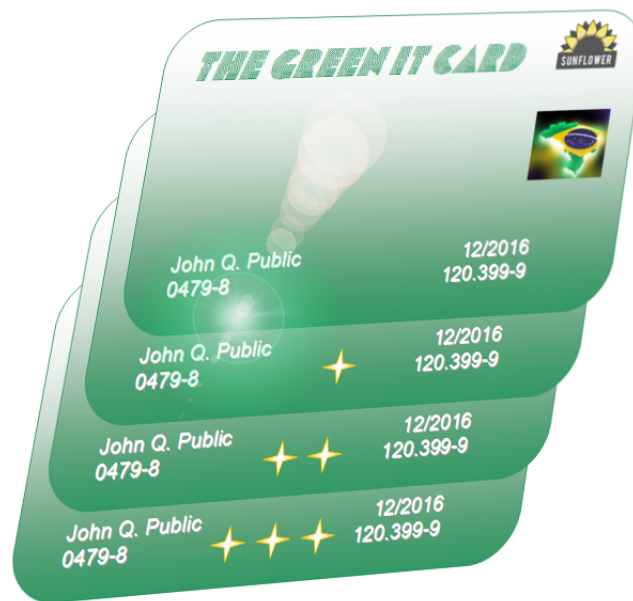
Fig. 3. The four green cards.

2 - two stars; d) level 3 - three stars. This card will be activated whenever the manager take public charges and disabled when targeted for natural exoneration.