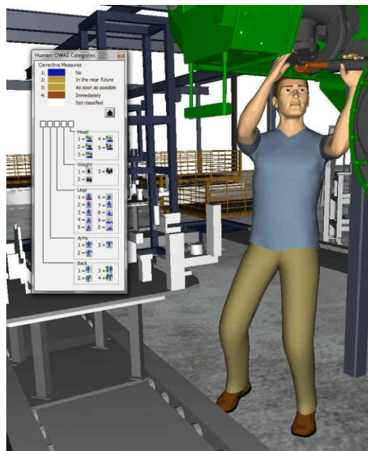
Fig. 3. Evaluation of overhead work using the OWAS method [3, p. 20; Software: 6]

There are a number of methods for analysing, evaluating and assessing human static posture and holding work based on kinematic assumptions or even practical approaches. They include the OWAS method (Figure 3) developed in Finland as well as the Guidance Characteristic Method that is widely used in Germany. Interactive calculation forms for the latter method are available on the internet. It also takes into account the time required for a particular static posture or holding task in the form of frequencies per shift.