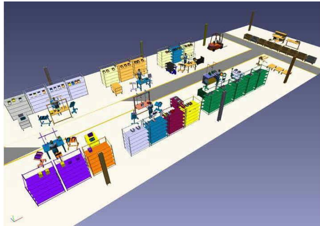
Fig. 1. Visualization of an assembly system [Software: 2]

Figure 1 shows an exemplary virtual representation of a manual assembly system. The new guideline part focuses on the methods available in Germany. Stresses and strains caused by the working environment will be the subject of a future part of the guideline. The current Guideline Committee is composed of representatives from science and software companies as well as industrial users. The draft VDI Guideline 4499 Part 4 [3] was published in 2012. After processing of objections, the final version will appear along with an English translation in mid-2014.