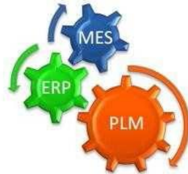
Fig 2: Functional Areas of I.T. Enterprise Architecture. The figure shows the three integrated areas of Product Lifecycle Management, Enterprise Resource planning, and Manufacturing Execution Systems [6].