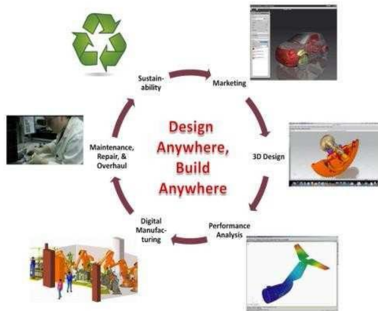
Fig 4: Stages of PLM. This figure shows the different stages of Product lifecycle management.

The academic institutions in Michigan are striving hard to develop the PLM skills in their students and while doing so they face the challenge of lack of I.T. infrastructure to provide them with the necessary tools and processes. A collaborative online approach that provides them the necessary tool infrastructure and support along with the course curriculum is thus needed [1].