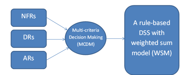
Fig. 1. Pictorial representation of the problem

domain. Existing systems focus on ACs and DRs only [14] and does not take NFRs into account. Our proposed DSS takes all three areas into consideration and uses a knowledge base that has the ability to update its knowledge and suggest suitable choices to the software architect.