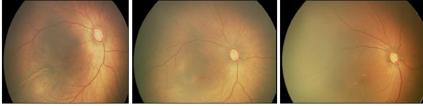
Figure4. The optic disc edge results with the third feature added.