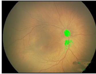
Figure1. Retinal image with candidate optic disc marked with green color

1000 but less than 10000 pixels. Clustered those pixels whose intensities are equal when divided by a certain histogram bin width which in this paper is 10, and sort the clusters according to the intensity. Start from the cluster with maximum intensity and check the number of pixels in it, if the number is less than 1000, then go to the next cluster in descending order of intensity until the number of pixels is between 1000 and 10000, and the intensity range of this cluster is determined as the threshold T . Those pixels whose intensities are brighter than the threshold are marked as candidate optic disc with a green color (0xff00ff00) as shown in Figure1.