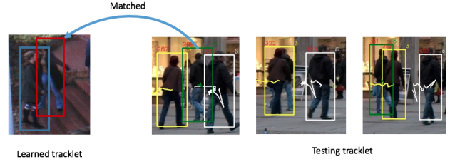
Figure 3. TUD-Stadtmitte dataset: Tracklet ID_8 represented by color "green" matches to closest tracklet in learned dataset to recover mis-detection caused by occlusion.