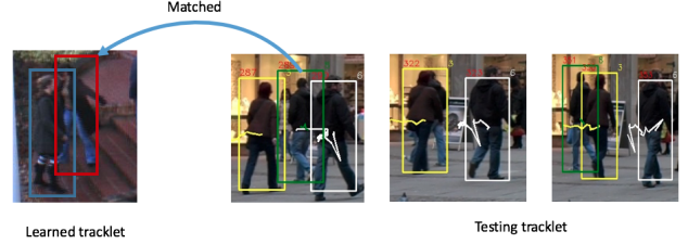
Figure 3. TUD-Stadtmitte dataset: Tracklet ID_8 represented by color "green" matches to closest tracklet in learned dataset to recover mis-detection caused by occlusion.