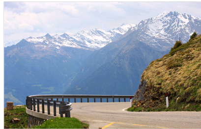
Fig. 1 Timmelsjoch-Hochalpenstrasse

of social consequences has been emphasized [4]. Laying out a future agenda for the IS field, Walsham suggests use of critical approaches and strong ethical goals in IS research. Let us give an example of a social dilemma. Imagine a tourist bus equipped with an intelligent remote diagnostic system (RDS). The RDS predicts a brake failure before entering downhill on Timmelsjoch-Hochalpenstrasse (Fig. 1), and a potential accident is luckily avoided.