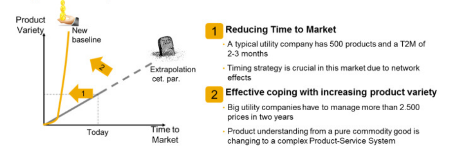
Figure 1 Balancing the goals of a high product variety and reduced time-to-market

In the following figure the conflict of objectives between time-to-market and a high level of product variety is shown: