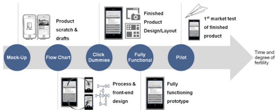
Figure 2 – Early Prototyping Process

Prototypes can come in many different shapes [3]. For example, as mockups in a “fake it till you make it” fashion, as click dummies that simulate the user experience of apps on mobile devices, or fully functional prototypes (see Figure 2).