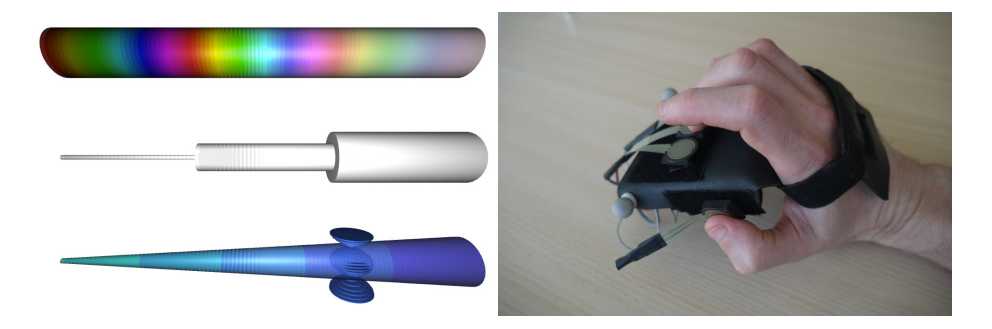
Figure 3: Left: Audio/visual Tunnels dedicated to sound modulations: Color/pitch (top), size/volume (middle) and combined pitch/volume (bottom), with a reactive widget being manipulated. Right: The Piivert input device with markers for 3D interaction and pressure sensors for musical gestures.

The first circle connects the musician with his or her instrument.