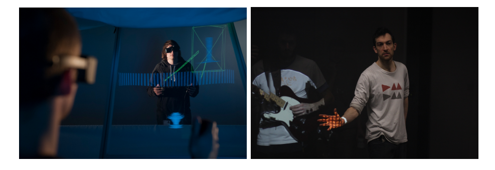
Figure 4: Left: Drile played by two musicians on each side of a semi-transparent 3D screen. The musician on the other side of the screen has selected a reactive widget using virtual rays from his both hands. Right: Two musicians interact through the Reflets system. One musician uses a 3D interface to grab and process the sound of the guitar played by the musician reflected in the mirror.

The second circle connects the instrument and musician to the other musicians of the band.