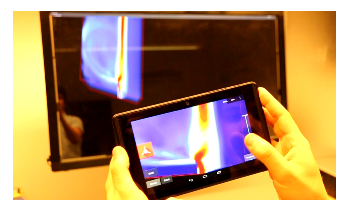
Figure 2: The overall data exploration setup including the interface on the position-aware tablet.

Communication between the devices uses the UDP protocol and we send absolute transformation matrices to ensure that packet loss does not negatively impact the display/tablet synchronization.