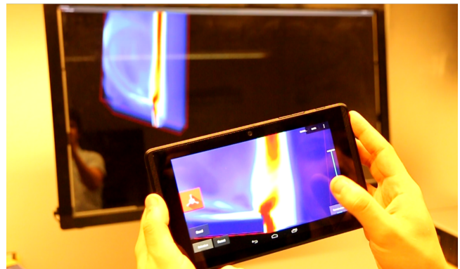
Figure 2: The overall data exploration setup including the interface on the position-aware tablet.

We process datasets with the VTK library. 3 We render them with OpenGL ES 2.0 on the tablet and OpenGL 3.0 on the large display.