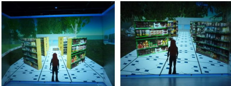
Fig. 2. Trials in SL: Plus perspective – A point (left) and Minus perspective – B point (right)

We conducted trials of the learning module with five volunteer participants, using a Think-aloud protocol [34] to gather data. Participants were asked to talk about what they were doing while active in the trials. The trials were video recorded to not interfere with the participants while they completed their tasks. All had prior experience with virtual reality environments. They gave verbal consent for use of video recording of their trials. We first showed them a 2D diagram of a food store (Fig. 1, right) and asked which perspective would be their preferred starting point (A or B). Although everyone did choose B, most of the responders were hesitant and unsure. We then had the participants try out the module in SL (Fig. 2) and in vA (Fig. 3).