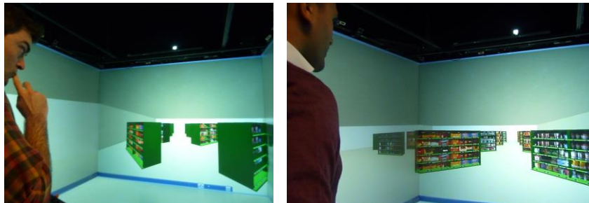
Fig. 3. Trials in vA: Plus perspective – A point (left) and Minus perspective – B point (right)

All five participants trialed the module in vA and three of them in SL (Table 1). We used the ‘identification times’ as an objective metric of their effort for location of three items in the food store. In all trials, the ‘identification’ time values were smaller for perspective B, even when the items sought after were made different across trials. This trend was consistent across both VLE platforms.