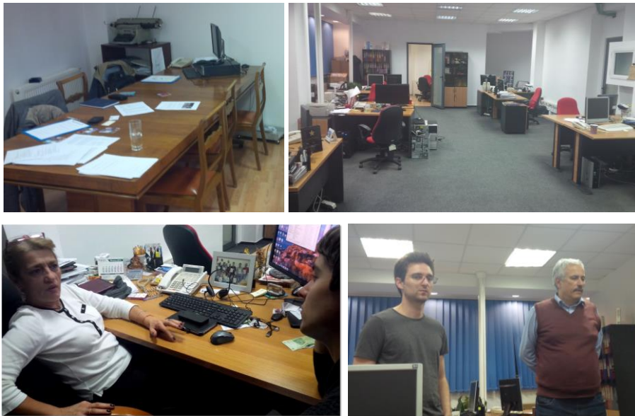
Figure 2. Study settings (clockwise from top left): (a) table for briefing participants, (b) open plan office area, (c) researcher and interpreter on site, (d) participant at her desk.

Participants and Setting. Older knowledge workers (aged 50 years and above) are a heterogeneous group, characterized by different needs depending on physical, cognitive, and social constitution [6]. For the present study we focused on a subset of that group: knowledge workers who use computers on a daily basis and spend most of their time in the office (cf. with the Anchor and Connector working types described by Greene [12]). A convenience sample of eight older knowledge workers (two women) was drawn to take part in the contextual interviews and observations. The mean age was 55 years ( SD = 3.93 ). The participants were recruited from two small IT companies in Bucharest that worked in hardware and software engineering in the domain of fiscal accounting. All participants were frequent users of smartphones, tablets, and laptops. The interviews and observations took place directly at the participants' workplace (see Fig. 2 below) and lasted for 60-90 minutes.