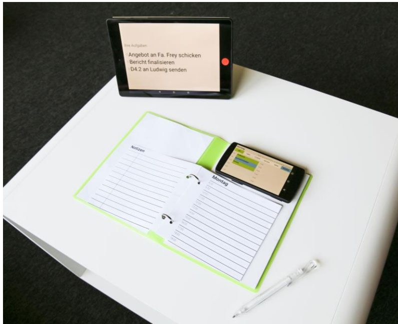
Figure 3. A mockup representing the Digital Paper Calendar and the Private Digital Noteboard.

tion on his Private Digital Noteboard that he uses for displaying tasks and to-do's. He confirms the new time by touching the "accept" button on the display. He then also changes the time in the Digital Paper Calendar by simply drawing an arrow with his smart pen from the 10 a.m. to the 11 a.m. line.