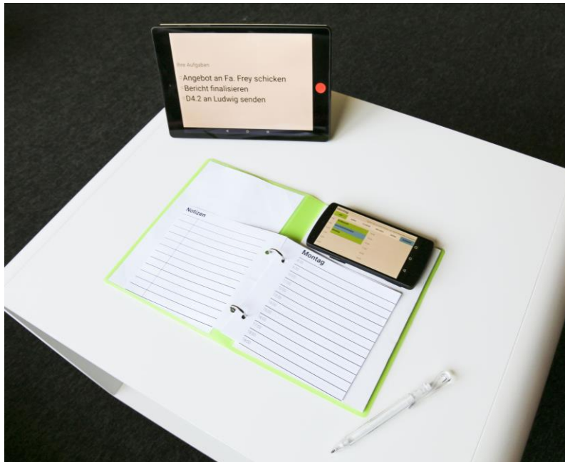
Figure 3. A mockup representing the Digital Paper Calendar and the Private Digital Noteboard.

tion on his Private Digital Noteboard that he uses for displaying tasks and to-do's. He confirms the new time by touching the "accept" button on the display. He then also changes the time in the Digital Paper Calendar by simply drawing an arrow with his smart pen from the 10 a.m. to the 11 a.m. line.