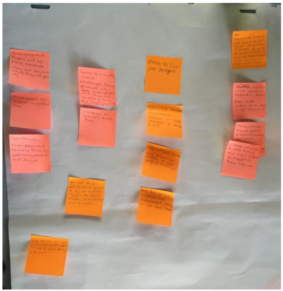
Figure 7. Group D - Political issues and further stakeholders in the process.

Group D did not hence provide further insights to the existing personas as per needs, requirements and aspirations. Yet, by discussing political issues they implied further stakeholders and proposed ways to undertaking interactions with them (Figure 7).