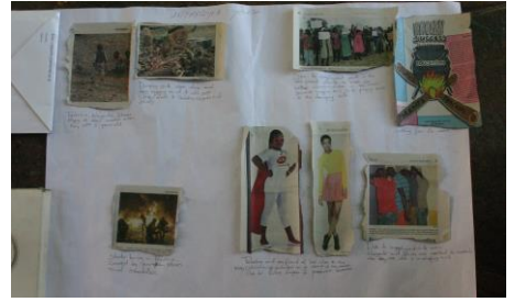
Fig. 4. Collective characters - holistic stories.