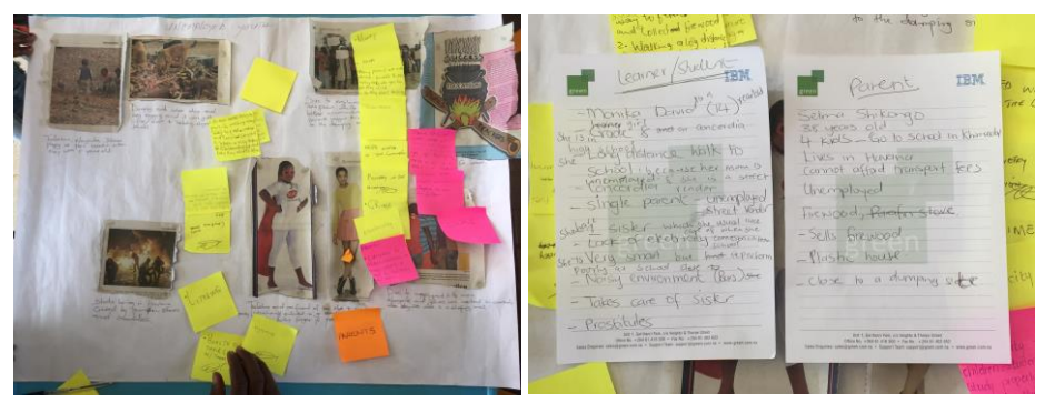
Fig. 5 & 6. Personas developed on Sticky-Notes<sup>TM</sup> & Two Persona profiles: student & parent

Eventually, Group C decided to summarise their findings into two character profiles typical of UCD personas proceedings: a learner/student and a parent (Figure 6).