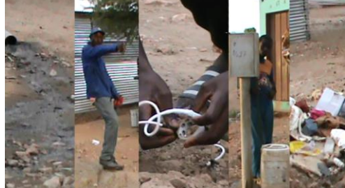
Fig. 1. Participants walking Havana. Fig. 2. Hygiene, spirits, illegal wiring, water, wasteland.