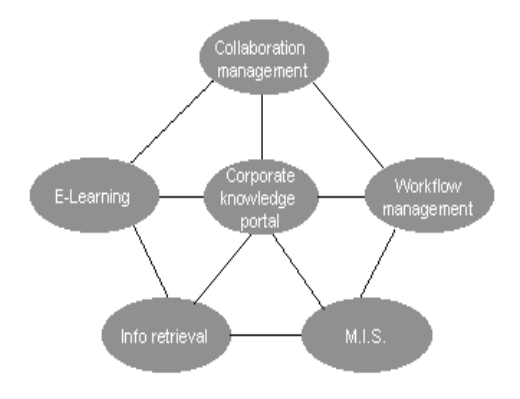
Fig. 1. Elements of Corporate Portals

Going further - Corporate Portal - can be defined as an integrated user interface, developing websites, and for the exchange of information, knowledge management in the company and the implementation of various business transactions. This is a point of access to all information resources and applications used. It integrates systems and technology, data, information and knowledge to function in the organization and its environment, in order to allow users a personalized and convenient access to data, information, knowledge, according to the tasks arising from their needs, anywhere, anytime, in safe manner and through a single interface. More advanced portals act as powerful workplace to ensure collaboration and exchange of documents. Fig. 1 [24]