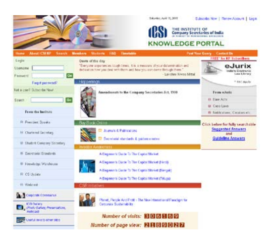
Fig. 3. ICSI - Knowledge Portal

Next presented KP is ICSI Knowledge Portal (ICSI-KP) "a capacity building initiative of the Institute of Company Secretaries of India (ICSI) for its members and students is a reservoir of knowledge enabling the users access to huge pool of information including Bare Acts, case laws, notifications and circulars issued by Government and regulatory authorities from time to time" – description available from eJurix on the ICSI KP home page Fig. 3 [23].