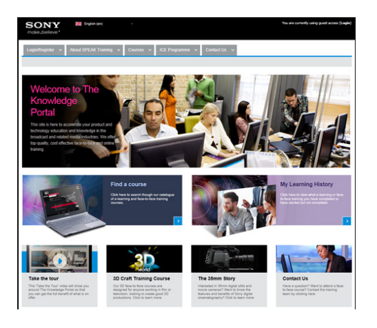
Fig. 4. Working with SONY Knowledge Portal

Another example of knowledge portal is depicted in Fig. 4 (available at [20]). The goal of its solution is to convince to company products as well as to offer complete courses devoted to accelerate user skills.