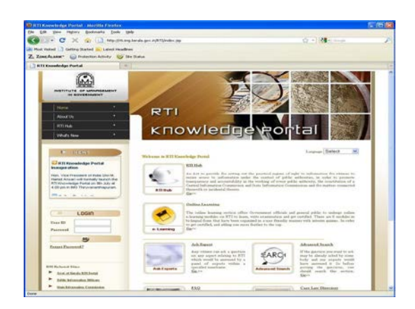
Fig. 2. An example of RTI Knowledge Portal

One of the oldest knowledge portals is presented in Fig. 2 (see: [19]). Main functionality of the portal concerns to co-operation with experts, e-learning offerings, Case Law Directory apart of typical FAQ (frequently asked questions) capabilities.