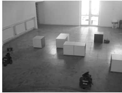
Fig. 5. The experimental workspace with obstacles

The conducted experiment involved two Pioneer P3-DX robots that were moving in a workspace with fixed and mobile obstacles (see Fig. 5). Fixed obstacles are represented by the white boxes, and the mobile obstacles are two AmigoBot robots that were moving on predefined paths.