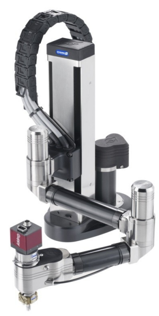
Figure 6: Miniature Modular Arm MGA.