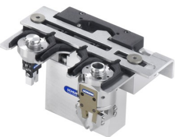
Figure 4: End effector: Parallel Micro Gripper MWPG