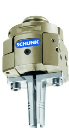
Figure 4: End effector: Parallel Micro Gripper MWPG