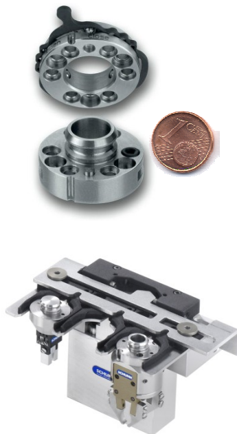
Figure 5: Micro Tool Change System MWS and Storage Rack MWM