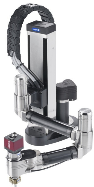
Figure 6: Miniature Modular Arm MGA.