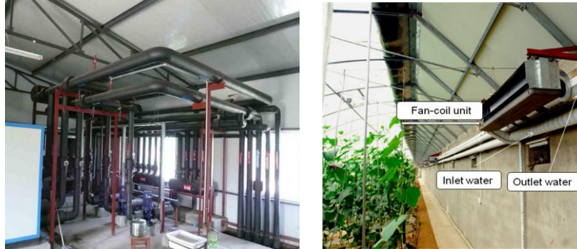
Fig.1 GSHPs and agricultural greenhouse in test.