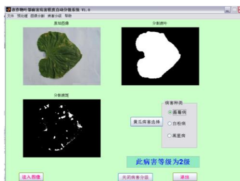
Fig.3 Results of disease harm degree

Finally, according to the harm degree of plant disease and classification results, disease grade was shown, especially for cucumbers, grapes and corn disease harm degree of determination, specific for disease automatic grading of cucumber downy mildew, powdery mildew and scab, grape downy mildew, powdery mildew and anthracnose and corn big spot, leaf blight and grey spot disease. The results interface of the crop disease harm degree is shown in Fig.3.