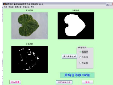
Fig.3 Results of disease harm degree

Finally, according to the harm degree of plant disease and classification results, disease grade was shown, especially for cucumbers, grapes and corn disease harm degree of determination, specific for disease automatic grading of cucumber downy mildew, powdery mildew and scab, grape downy mildew, powdery mildew and anthracnose and corn big spot, leaf blight and grey spot disease. The results interface of the crop disease harm degree is shown in Fig.3.