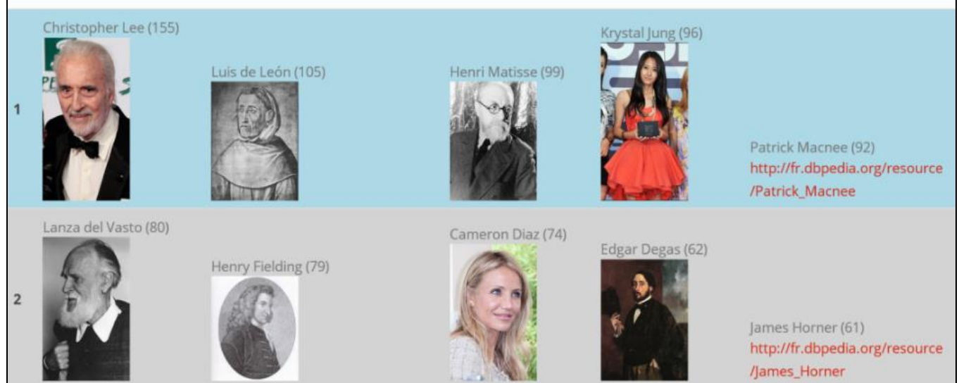
Fig. 3. Crossing DBpedia artist category with edition history data

06/2014 << 05/2015 << 06/2015 >> 07/2015 >> 06/2016