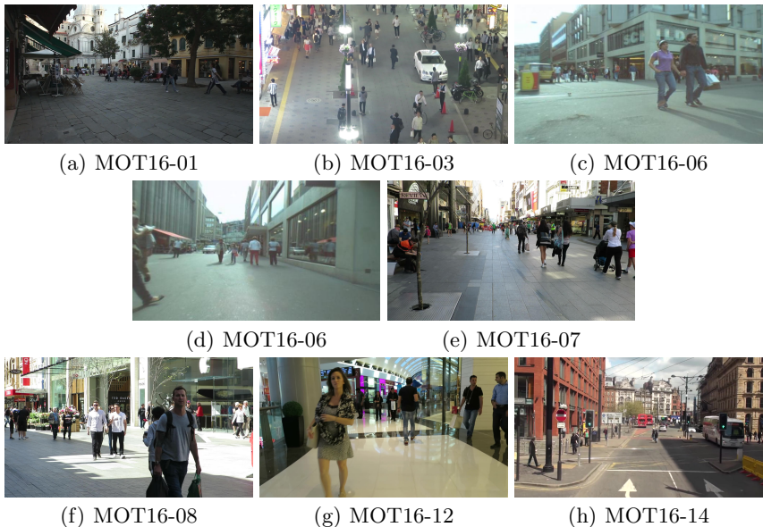
Fig. 2. Samples images from the MOT 16 test sequences.

As explained above, we use the public pedestrian detections provided within the MOT16 challenge. These static detections are complemented in two different ways. First, we extract velocity observations by means of a simple optical-flow based algorithm that looks for the most similar region of the next temporal frame within the neighborhood of the original detection. Therefore, the observations operator P is the identity matrix, project the entire state variable into the observation space. Second, the appearance feature vector is the concatenation of joint color histograms of three regions of the torso in HSV space.