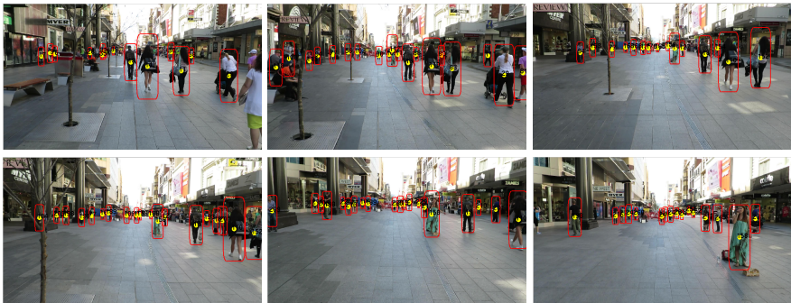
Fig. 4. Sample results on the sequence MOT16-07, encoded as in the previous figure.

consistent false detections could lead to the creation of a false track, therefore tracking an inexistent pedestrian. On the positive side, the main advantage of the proposed model is that the probabilistic combination of the dynamic and appearance models can decrease the probability of switching the identities of two tracks.