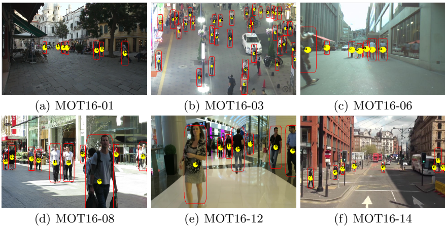
Fig. 3. Sample results on several sequences of MOT16 datasets, red bounding boxes represents the tracking results, and the number inside each box is the track index.