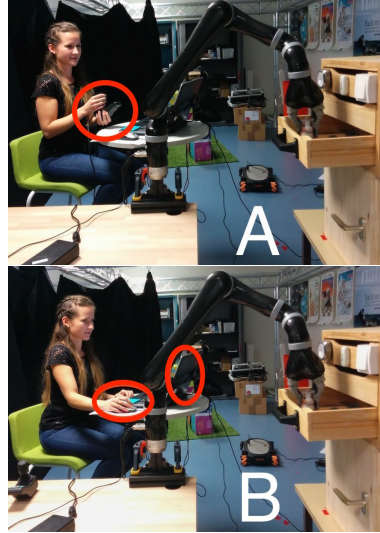
Fig. 1. The experimental setup with the Kinova Jaco arm. The participant moves the arm using (A) the joystick and (B) the graphical interface on the laptop.

Our second hypothesis is that individual factors, such as traits and attitudes, may influence the user performances with the robot interfaces. There is indeed prior evidence that some personality traits have significant effects on the perceived ease of use of new technologies, such as smartphones [7]. There is also