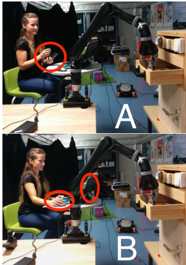
Fig. 1. The experimental setup with the Kinova Jaco arm. The participant moves the arm using (A) the joystick and (B) the graphical interface on the laptop.

Our second hypothesis is that individual factors, such as traits and attitudes, may influence the user performances with the robot interfaces. There is indeed prior evidence that some personality traits have significant effects on the perceived ease of use of new technologies, such as smartphones [7]. There is also