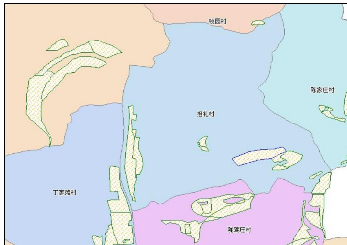
Fig. 3. Chart of traceability result—information of field parcel

According to the traceable code, the system shall directly illustrate the concrete position of the field parcel of the fruit, and also information such as the corresponding county name, town name and village name could be found. As illustrated in Fig. 3, consumers could learn that the field parcel is in the Danli village, Miaofengshan town of Mentougou District, Beijing. When the user clicks the field parcel on the map, information such as planting personnel, water, air, soil nutrient, fertilizer use, pesticide delivery and product inspection could be queried.