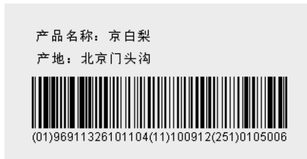
Fig. 2. Traceable label of fruit

The traceable label also includes the goods name, producing area and other information consumers concerned in form of the text besides the traceable code.