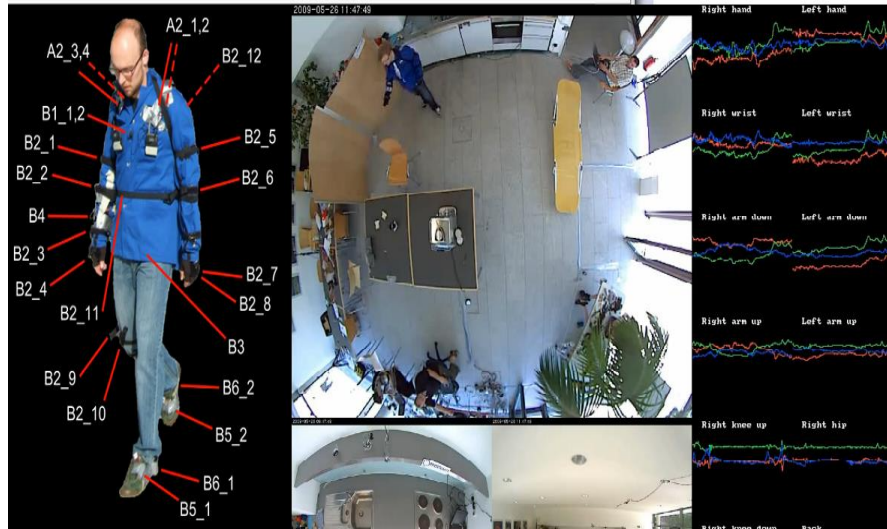
Fig. 1. Sample data from OPPORTUNITY activity recognition dataset [1]

this large database consisting of sensor data recorded by the accelerometer attached to the right arm of the subject. We considered 10 low level activities of interest plus an unknown activity category. The acceleration data were sampled with 64Hz yielding approximately 4,200 frames. Fig. 1 shows the screen shot for the dataset we used in our experiments.