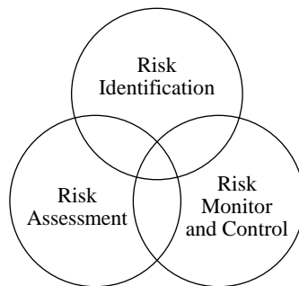
Fig. 1. Change Risk Assessment Model Processes

CRAM is composed of three interrelated processes which are continually recorded and monitored. CRAM processes accomplish specific risk objectives, which are applied to projects or at a greater extent to business environments with a view to facilitate and control change risks. A schematic interpretation of CRAM processes can be seen in Fig. 1.