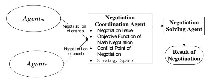
Fig. 1 Process of Nash negotiation based on Agent

Model of Nash negotiation can be solved by mathematical derivation if the object function is simple. We can get the solution to set the first derivative is equal to zero and the second derivative is less than zero. But when \prod (u_i(x) - d_i) is not