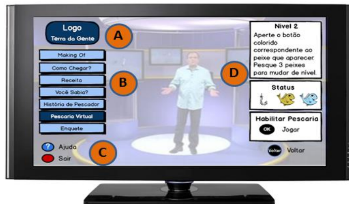
Fig. 4. First Prototype for the iTG application.

The results from the practices supported the construction and evaluation of an interactive prototype for iTG (Fig. 4). For example: “A” detail shows the simple layout that covers only the screen edges, following the headquarter premises to “provide least possible impact on TV content” ; the “B” detail shows a menu with few options and few hierarchical levels, which is directly linked to the requirements: “the application should be easy to understand and use” and “application with short interaction path (with a few steps to reach the goal)” . The “C” detail represents treatment for the requirements: “clearly show the application features and relate them to the remote control’s buttons” and “the remote control should be the main interaction device (due to costs)” . Finally, “D” detail shows a game to motivate the viewers to interact with the program content; this feature represents the requirement: “the application must challenge and encourage users to interact (motivation should be associated with the application content)” .