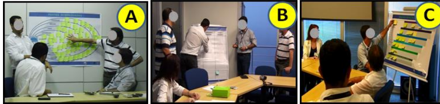
Fig. 2. Participatory activities in a situated context.

the participants point of view. This activity was key for identifying the main forces as well as constraints that the team would face during the project.