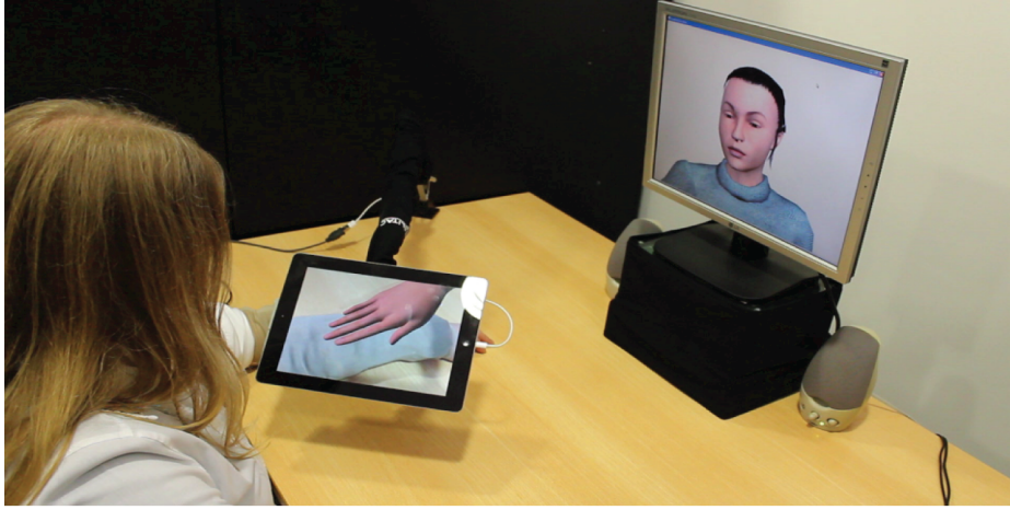
Fig. 1. The components of the TVA setup. The monitor displays the agent’s upper body, allowing the agent to gaze at, and talk to the user, as well as show body movements in accordance with the touch. The tablet computer displays the agent’s hand touching the user. The user wears a vibrotactile sleeve to generate a tactile sensation in accordance with the agent’s touch.

Social touch by ECAs, might be especially beneficial for interactions with physically embodied agents, such as social robots. In a study where participants observed videos of tactile interactions between a human and a social robot, it was found that social touch made the robot seem less machine-like and more dependable [17]. Other research, in which a social robot actually touched participants, found that social touch by a robot can enhance compliance to requests. After having their hand stroked by a robot, participants spent significantly more time on a repetitive task, and performed significantly more actions during the task [72].