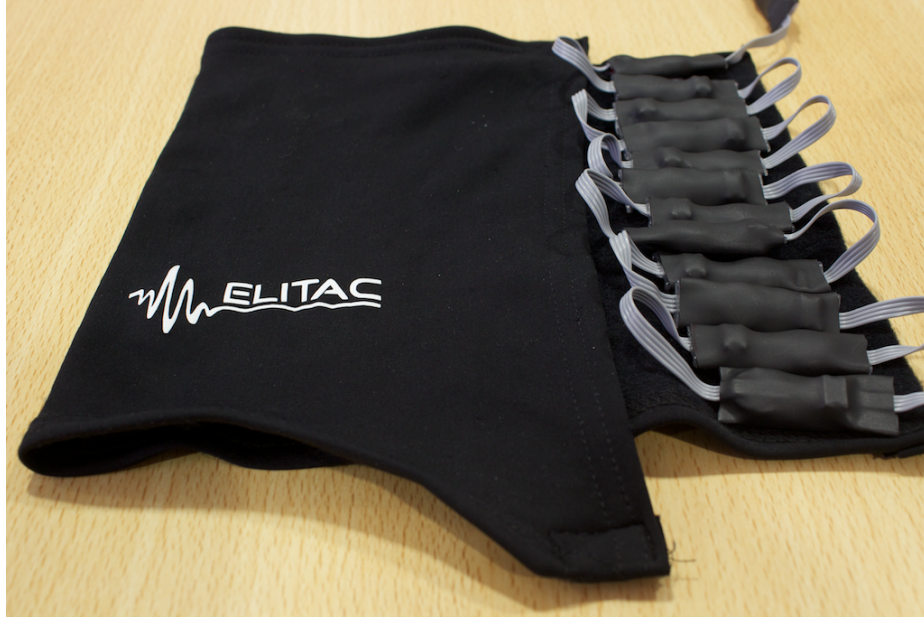
Fig. 3. The vibrotactile sleeve with 12 vibrationmotors

Vibrotactile sleeve. To generate the tactile sensation of the agent's touch we used an Elitac Science Suit. 1 The Elitac Science Suit is a modular system consisting of several eccentric mass vibration motors that can be attached to elastic bands of different sizes using Velcro. The intensity of vibration of each vibration motor can be individually controlled, with four levels of vibration intensity available. We attached 12 vibration motors to an arm-sized elastic sleeve, with approximately half a centimeter spacing between each motor, creating a high resolution tactile display (Figure 3).