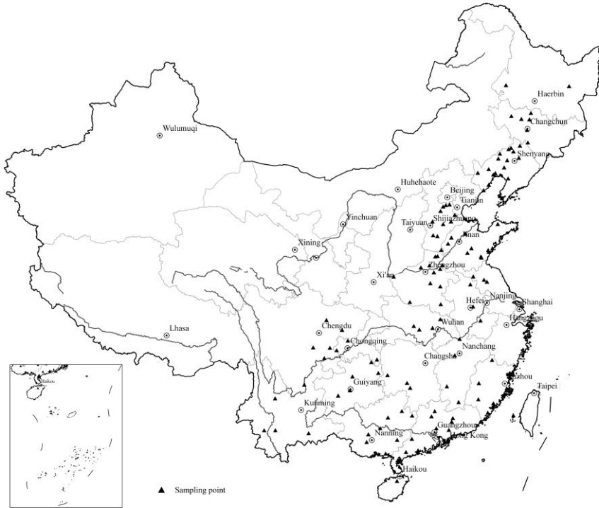
Fig. 1. Sampling points distribution map of 2008

Meteorological factors are provided by China Meteorological Data Sharing Service System, they are log data of 756 stations during peanut growth period. Process meteorological factors in Geostatistical Analyst module of Arcgis9.2 software, use ordinary Kriging method to calculate the spatial interpolation of meteorological factors at 756 points, and then use Extraction command to extract the data.