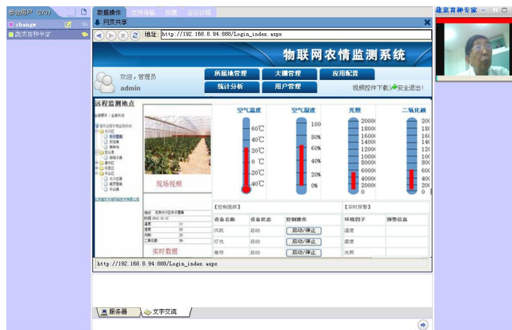
Fig.2 The experimental results