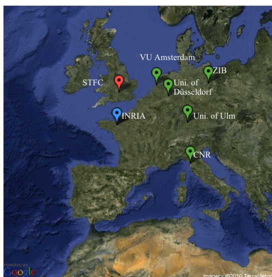
Figure 1: XtreamOS open permanent testbed

Throughout the project lifetime, we devoted a lot of efforts towards the XtreamOS open source community to further disseminate the XtreamOS technology. One of the project main achievements is the XtreamOS open testbed. Anyone can request an account and execute applications on an XtreamOS Grid formed of PCs and clusters provided by XtreamOS partners. At the end of the XtreamOS project, the open testbed contains 14 nodes (see Fig. 1): 2 nodes run global core services and 13 resource nodes support user applications. The core nodes are located at STFC, UK and INRIA, France. The resource nodes are distributed as follows: 2 nodes at INRIA (France), 1 node at VU Amsterdam (The Netherlands), 1 node at the University of Duesseldorf (Germany), 3 nodes at University of Ulm (Germany), 6 nodes at CNR (Italy), 1 node at ZIB (Germany). In the future, any institution will be able to join XtreamOS Grid by providing resource nodes. We have also made available to the community ready to use virtual images of the XtreamOS system for KVM and Virtual Box. Moreover, we have produced XtreamOS images for the automatic deployment of an XtreamOS Grid on Grid 5000 large-scale experimentation platform.