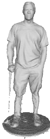
Fig. 3. 3D scanned mesh model of man with a crutch.

During testing we used a volumetric model constructed from 512 \times 512 \times 512 voxels and a model resolution of 256 voxels/meter. Using the same settings on a high-end desktop PC we were able to process 30 depth frames/second allowing real-time reconstruction. We also tested different indoor lighting and camera setups, including stationary and dynamically moving Kinect sensors. While we found the reconstruction algorithms to be more robust by using a stationary sensor and the turntable, illumination only affected the quality of the RGB colors and captured textures, but not the quality of the mesh models.