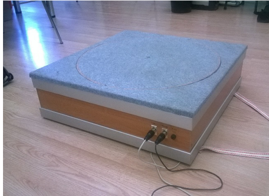
Fig. 2. The Arduino based scan turntable designed and constructed at Biotech Laboratory for 3D body scanning.

By using an additional HD camera it is also possible to obtain high definition RGB data for the scene which can be integrated into the 3D model by utilizing UV mapping to provide high definition textures. These HD textures can be stored with the exported surface-reconstructed body model and can later be used for a variety of medical purposes like automatic skin cancer detection. This technology is currently being implemented using Blender scripts.