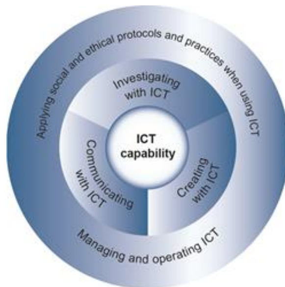
Fig. 3: The Australian Curriculum, Assessment and Reporting Authority [19]