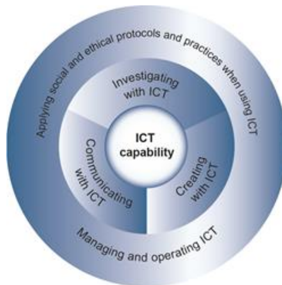
Fig. 3: The Australian Curriculum, Assessment and Reporting Authority [19]