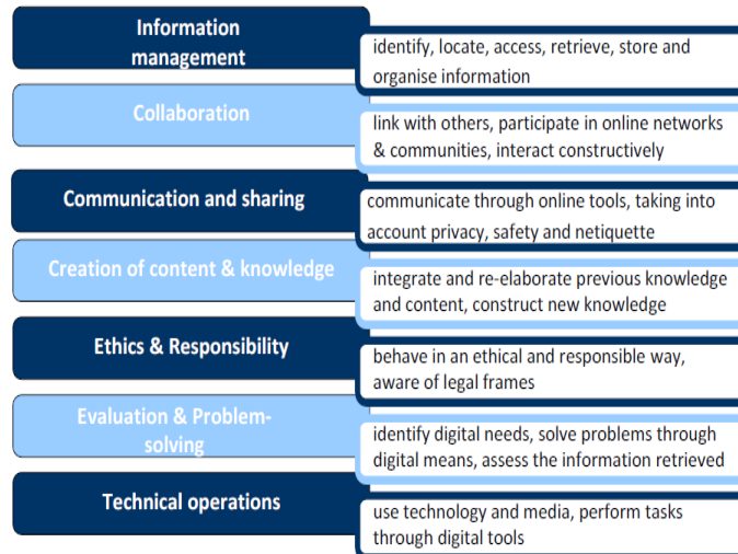
Fig. 2: Institute for Prospective Technological Studies [1]