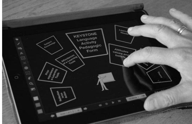
Fig. 1: Narrative ecology iPad infographic – blocks are manipulated (resized and moved) to prompt discussion