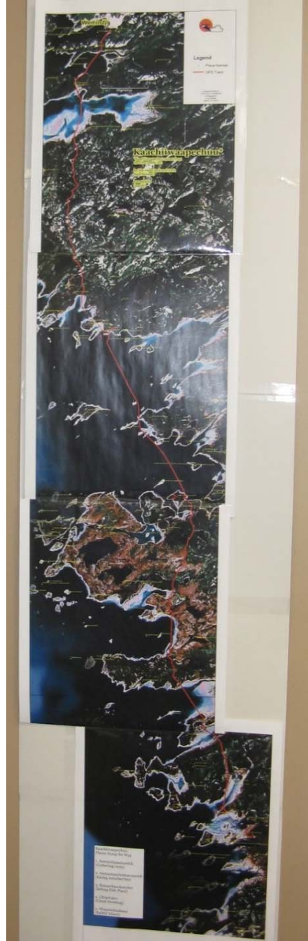
Fig. 2. Google Earth with kaachewaapechuu GPS line (Community Centre, Wemindji)