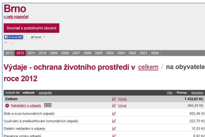
Fig. 1. Public expenditure on waste management per capita in Czech crowns [Kč] in the city of Brno in 2012.

We also needed a time series of municipal financial data. We tried to use the publicly accessible data from the web portals ARIS, ÚFIS, and MONITOR of the MoF. However, they do not provide simple tools for downloading publicly accessible data like the systems VISOH for the public or ALLISOH for the PA.