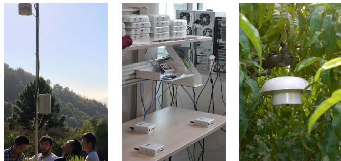
(a) Botanical garden, UC Berkeley, USA (b) Inria offices, Paris, France (c) Peach orchards, Mendoza, Argentina

We use a Metronome Systems’ NeoMote 1 as the heart of each sensor station. The NeoMote features a Cypress PSOC