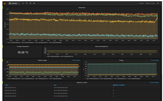
Fig. 4: Example dashboard for visualizing sensor the measurements and network statistics from the Inria Smart Building pilot deployment in real time.

In 2013, 85% of the peach production in the Mendoza region (Argentina) was lost due to frost events. The flowering period of the peach trees (September in Argentina) is a critical period. If during that period, temperature drops below -3 C for over 4 hours, the flower buds fall off and no peaches are