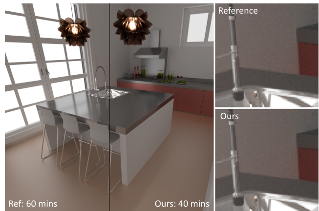
Figure 3: Interior scene rendered with 10000 paths/pixel, 4 diffuse/glossy bounces and 24 transmissions bounces using a sobol sequence. The reference image was generated using a classic Cranley-Patterson de-correlation method. The image referenced as "ours" was generated using our micro-jittered sampling technique. Both rendering times are reported from a NVIDIA 980Ti GPU.