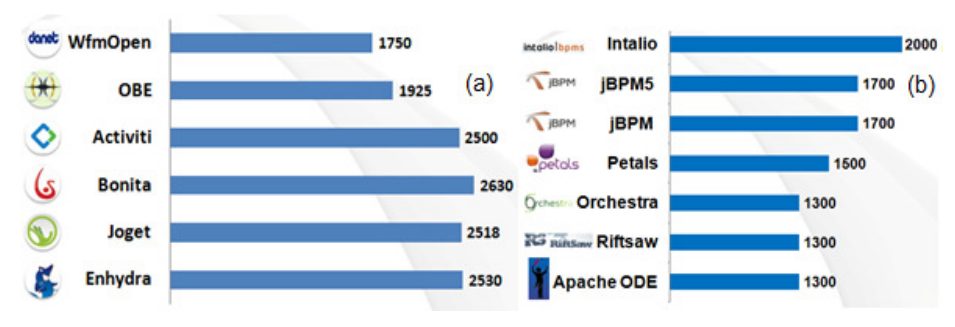
Fig. 3. Overall scores for evaluations: a) XPLD and BPMN 2.0; (b) WS-BPEL and BPMN 2.0

Fig. 3 shows the overall scores obtained by each tool in each evaluation, by means of the formula defined (c.f. Section 3.2). As mentioned above, to obtain those values the importance assigned to each characteristic by each organization performing the evaluation is also taken into account, to weight the most important ones. This final score serves mainly for the purpose of "eliminating" tools which does not reach certain level, focusing on the ones presenting the best scores.