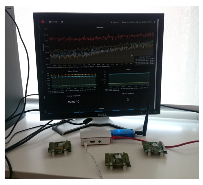
Fig. 3. The setup of the PEACH demonstration, including the motes, the manager and the web interface of the back-end system.