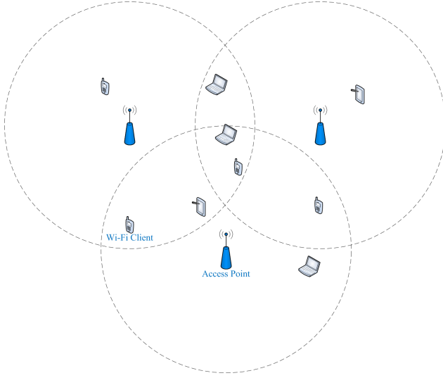
Fig. 2. Wi-Fi network having several clients

deployed nowadays. The base station of a Wi-Fi network is called “Access Point.” Fig. 2 shows three access points serving several Wi-Fi clients located within their coverage area.