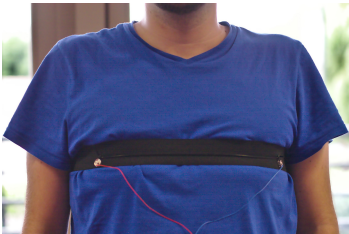
Figure 4: Various sensors could be integrated, e.g. a belt that measures breathing. From [5].