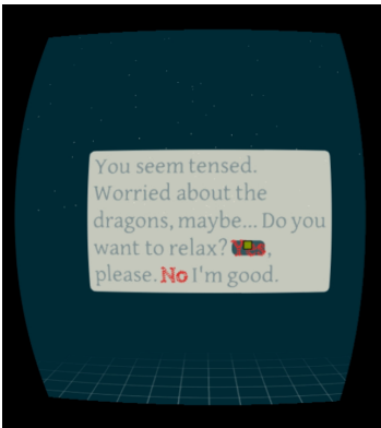
Figure 5: Users can interact with text elements in a more traditional way, using their gaze.

On the other hand, physiological computing is mature enough to assess mental states and emotions [3]. In particular, mobile brain imaging techniques like electroencephalography (EEG) can be employed to measure a variety of constructs such as workload or attention; cognitive processes that were harder to monitor in the past [4]. Physiological sensors are not restricted to the laboratory, nowadays they can be used in the field through carefully crafted wearables, e.g. [5]. These technologies make computers comprehend users [11].