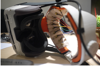
Figure 3: Prototype of a HMD device that directly embeds EEG electrodes – here a Vrvana Totem a .