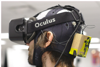
Figure 2: The Oculus Rift DK1 HMD a is combined with Neuroelectronics Enobio EEG cap b and OpenBCI amplifier c to both immerse and monitor user's brain activity.

Univ. Bordeaux 351 Cours de la Libération 33400 Talence, France jeremy.frey@inria.fr