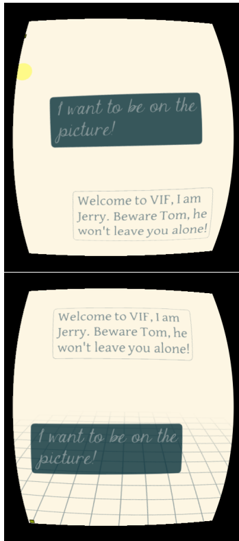
Figure 8: Events can occur depending on what players see and on texts' position, resulting in emerging game mechanisms that are physically involving.

My personal (re)discovery of the IF genre comes from the productions of the Inkle Studios 5 . Whereas I could not achieve a CYOA book when I was a child, their clever games designs kept me engaged throughout the stories, giving a clue on how to hook readers. Later on I found interesting perspectives on the whys and hows we may rely so much on stories within the preliminary chapters of [1], Bruno Bettelheim's book describing how significant fairy tales could be during child development.