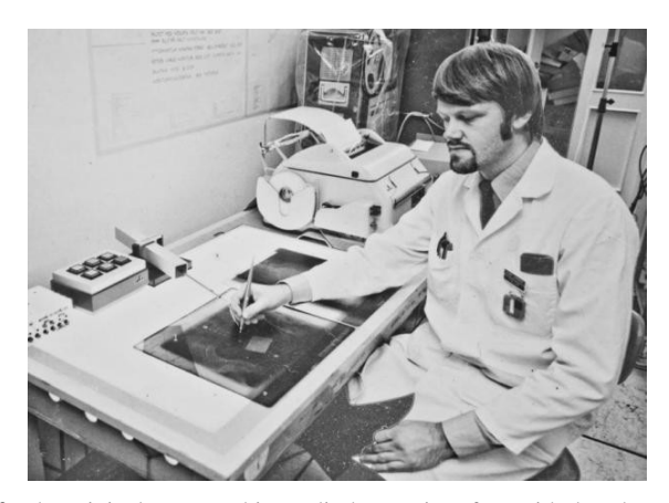
Fig. 2. The original man-machine radiotherapy interface with the Rho-Theta unit.

quality assurance from the early 1970s to late 1990s [7-13].