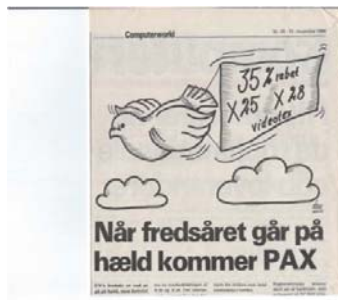
Fig. 5. Computer World's comment on X.25 charging

Before PAXNET went public, the PT&T had offered an X.25 service which we found were much too expensive. We managed to cut the price level with about 30%, but even with this cost reduction, the X.25 service never became a huge success.